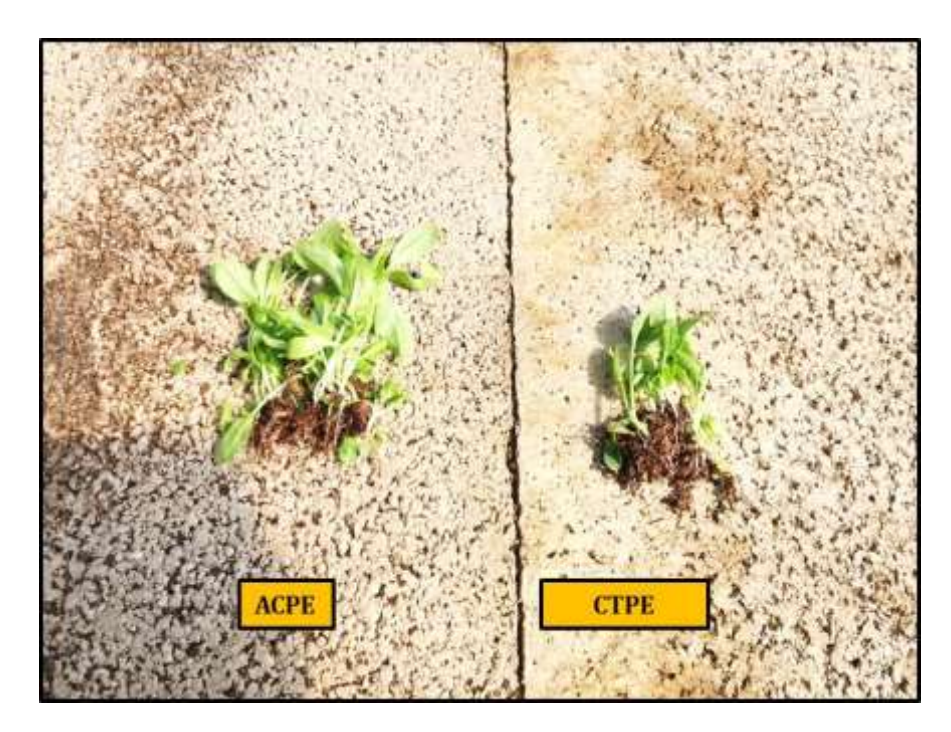
Figure 1 - Comparison between control in peat (CTPE) and treatment with organic acidifiers in peat (ACPE) on growth of Swiss chard ( Beta vulgaris subsp. vulgaris )