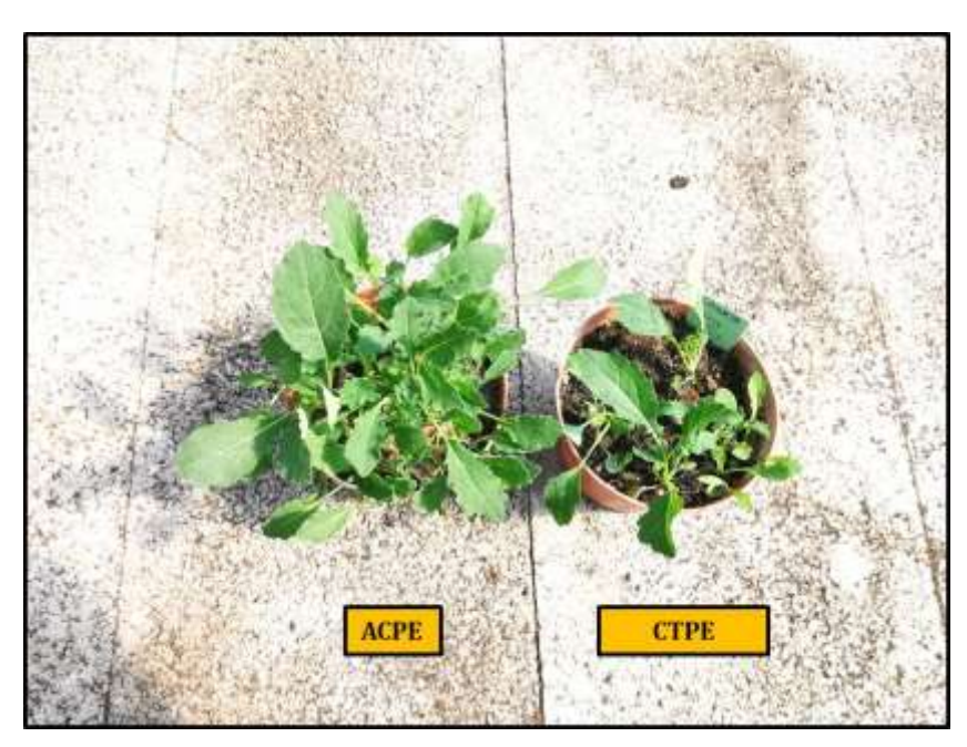
Figure 2 - Comparison between control in peat (CTPE) and treatment with organic acidifiers in peat (ACPE) on vegetative growth of Tuscany black cabbage ( Brassica oleracea var. acephala )