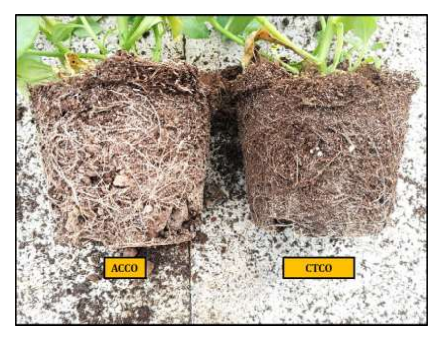
Figure 3 - Comparison between control in green compost (CTCO) and treatment with organic acidifiers in green compost (ACCO) on roots growth of Tetragonia tetragonioides

Figure 3 - Comparison between control in green compost (CTCO) and treatment with organic acidifiers in green compost (ACCO) on vegetative growth of Tetragonia tetragonioides