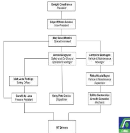
Figure 3: Organizational chart of CIMCAT

CIMCAT Trucking Corporation has an operations head who runs the operation followed by a safety on-ground operations manager who assists the operations head and manages the employees of the operation. As shown in Figure 3 is the organizational chart of the company.