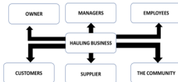
Figure 4: Stakeholder of CIMCAT Trucking Corporation