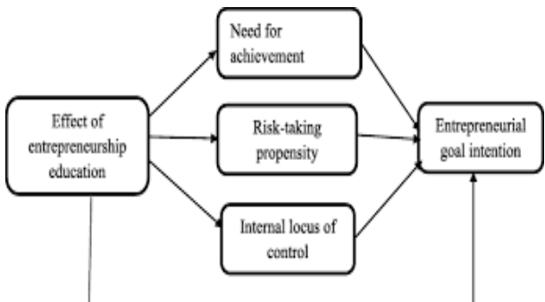
FIG1: ENTREPRENEURIAL EDUCATION.

Entrepreneurship education refers to a specified knowledge that inculcates in learners the traits of risk-taking, innovation, arbitrage, and coordination of factors of production for the unique purpose of creating new products or services for new and old users in society (9,10,11). Entrepreneurship is conceptualized as formal or informal structured learning that inculcates in students/trainees the ability to identify, screen, and seize available opportunities in the environment in addition to skill acquisition (12). Defining it as "a process of providing individuals with the ability to recognize commercial opportunities and the insight, self-esteem, knowledge, and skills to act on them" (12). Entrepreneurship education is a study of the source of opportunities and the process of discovery (13, 14). To Gartner (15) entrepreneurship is about entrepreneurial individuals creating innovative organizations that grow and create value, either for profit or not. But entrepreneurship does not have to include the creation of new organizations, it can also occur in existing organizations (16).